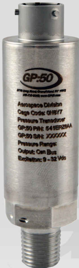
Model 541 High-Accuracy CAN Bus Transducer